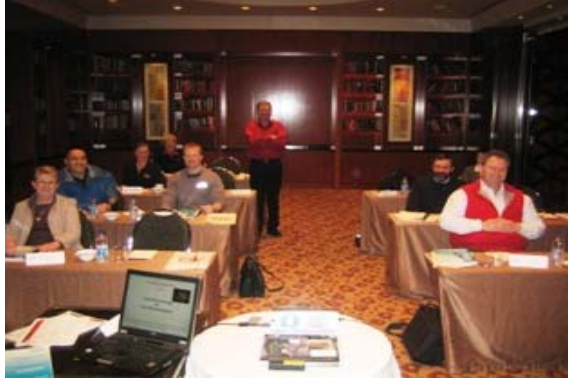
Training Course - Food Microbiology