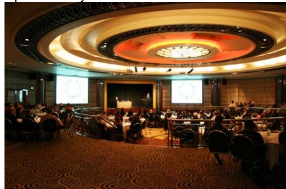
Conference Day Ballroom