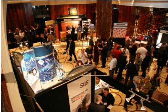
Trade Exhibition Area

12th - 14th September 2006, Park Hyatt Hotel, Melbourne