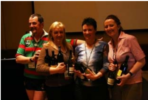
Trivia Night Winners